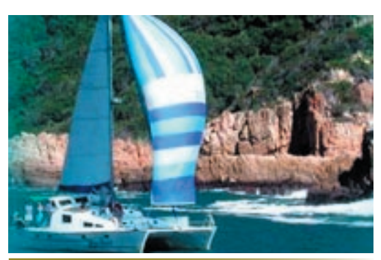
Sailing through Knysna Heads.