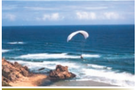
Paragliding down the coast.