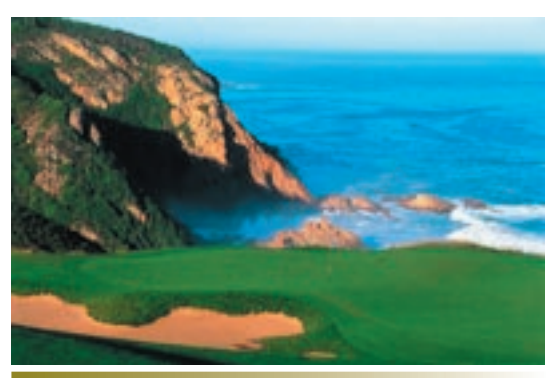
Seaside golf at Sparrebosch.

The Garden Route has numerous locations that allow for safe paragliding (both tandem and if qualified, individual). Paragliding allows you to glide above some of the most beautiful coastline the country has to offer.