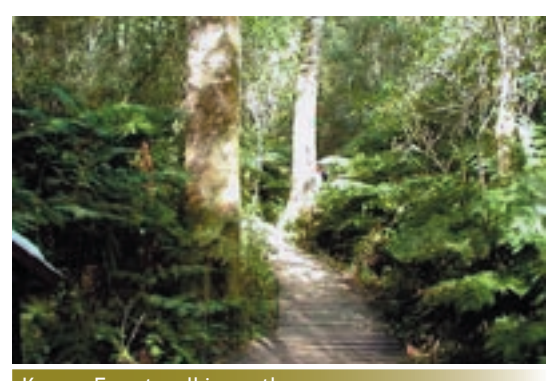
Knysna Forest walking path.