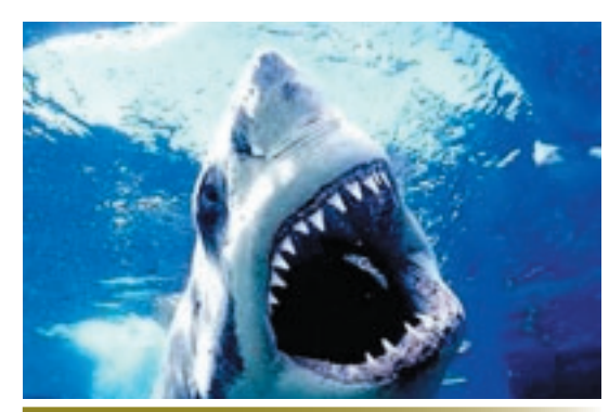
Great White Shark diving.