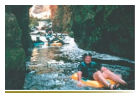
Storms River tubing adventure.

This involves travelling down a narrow gorge in tubes. It is a guided tour and you are supplied with the necessary equipment (helmets, tubes and wetsuits) It is a great day out, lasting approximately 6 hours (lunch is supplied).