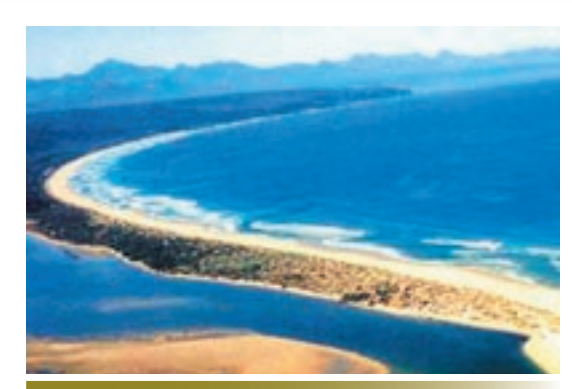
Endless beaches at Plettenberg Bay.

Much of the indigenous forests were destroyed in the early colonial days. However, the remaining forests are jealousy protected and are easily accessible to visitors. Walking, picnicking, bird watching, hiking and mountain biking are some of the activities enjoyed in the forest independently or on guided tours.