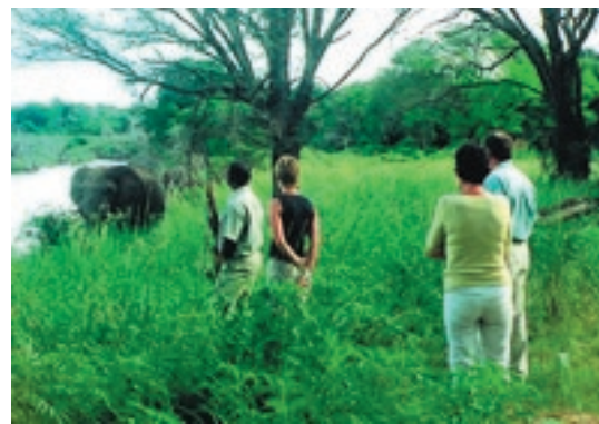
Bush walk with Ranger.