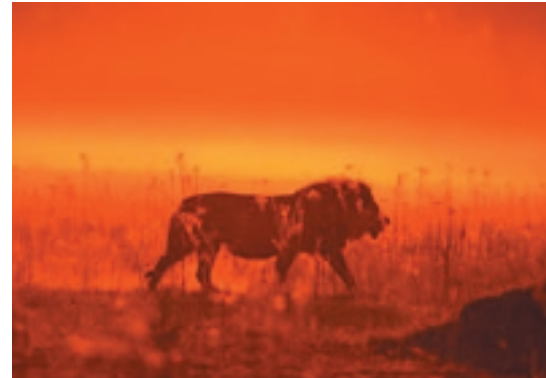
Big Game viewing up close.