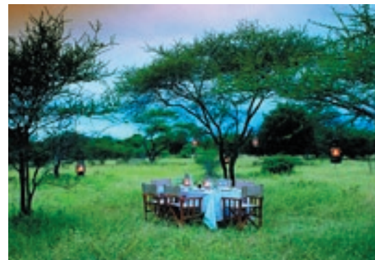
Bush dinner under big African skies.