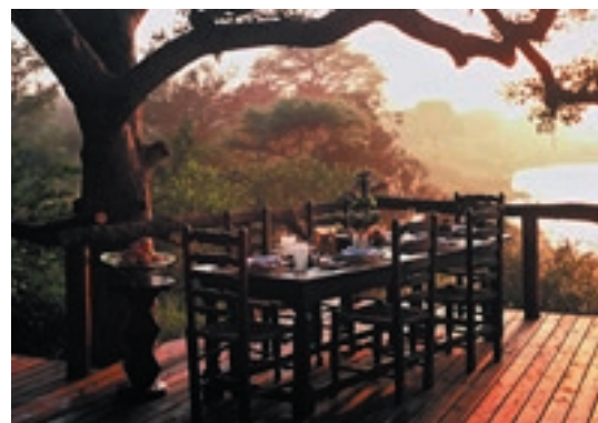
Dinner on the deck.