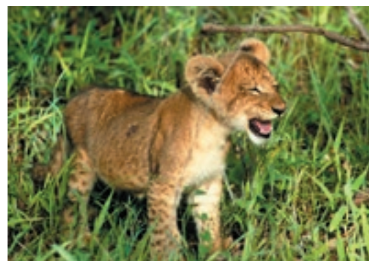
Lion cub in the wild.

Bookings / Queries Contact Luke Tel +27 (0)82 377 1398 Email luke@africabespoke.com Web www.africabespoke.com