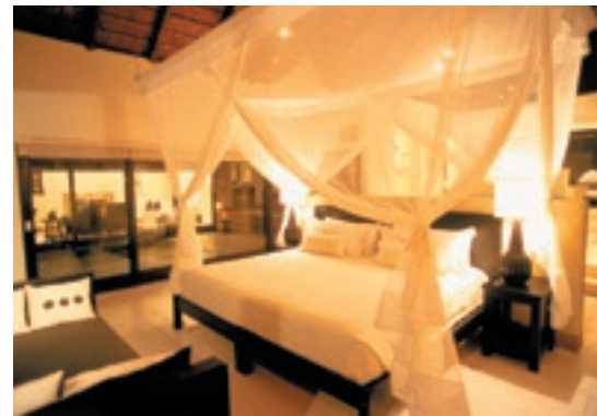
Ivory Lodge Suite.