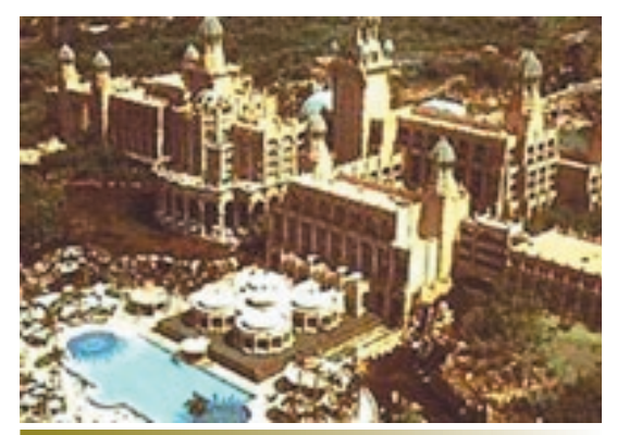
Palace of the Lost City

Rent your own car and drive to Sun City. Rates start from R250 per day.