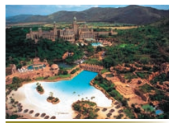
Palace of Lost City and Valley of the Waves

General Relaxation - excellent weather, beautiful surroundings, scenic walks and numerous swim-