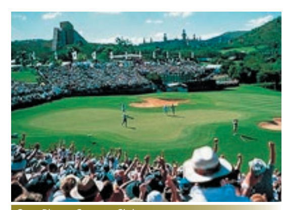
Gary Player Country Club