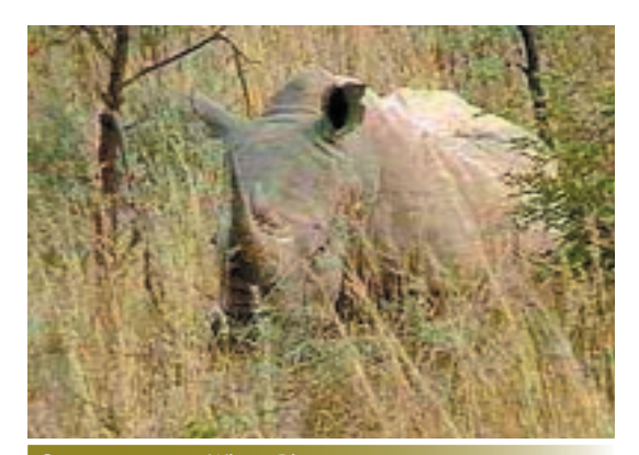
Game viewing - White Rhino